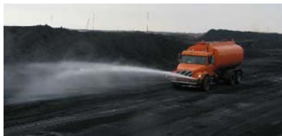
Applying water to control dust on coal pile