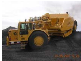
Coal Scraper working the coal pile