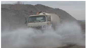
Applying Water to haul roads