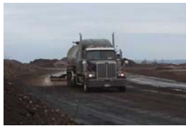
Applying Dust Suppressant