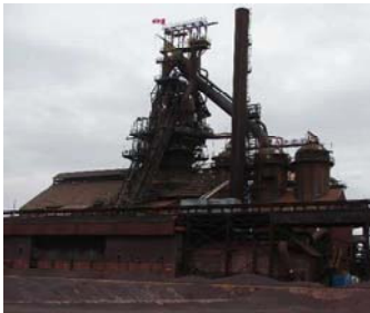
#6 Blast Furnace